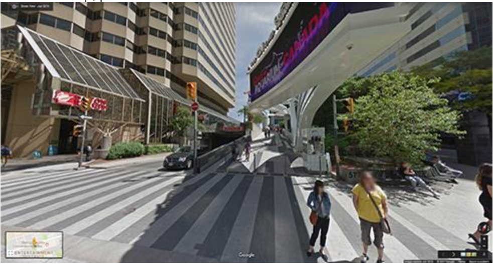
Directions to the Metro Toronto Convention Centre North Building, West Ramp